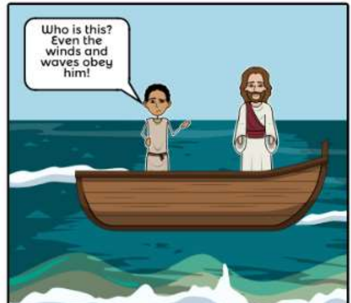
Who is this? Even the winds and waves obey him!