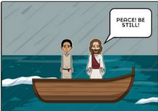
Jesus told the storm to stop and it did.