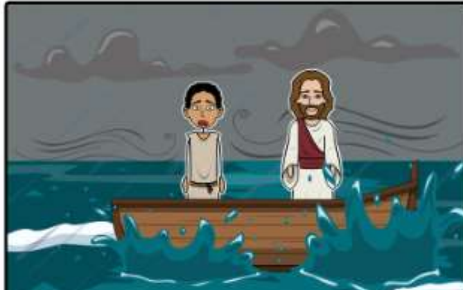
Suddenly, there was a massive storm that came out of nowhere. There was very strong winds and lots of rain and clouds.