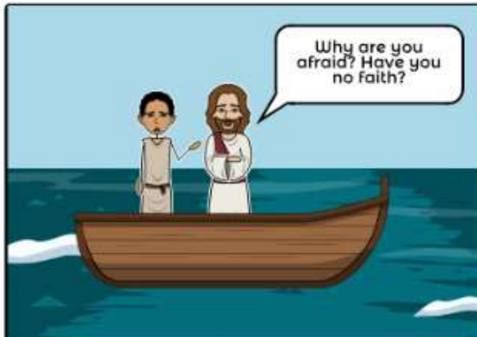
Then he asked his disciple why he was afraid. Do you not have Faith?