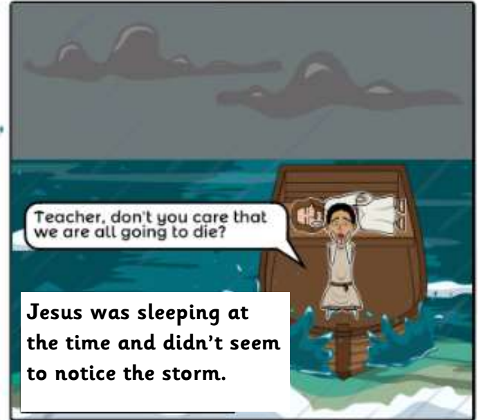
Jesus was sleeping at the time and didn't seem to notice the storm.