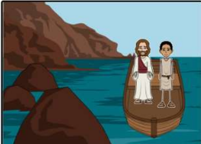
One day, Jesus decided to cross the lake with his disciples.