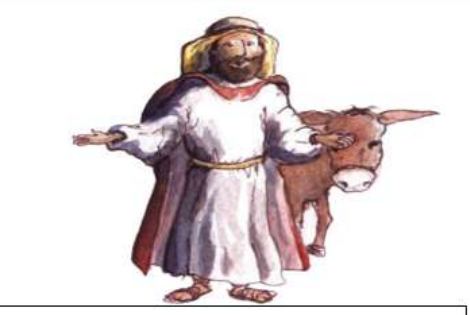
The Samaritan came over to the man lying on the side of the road.