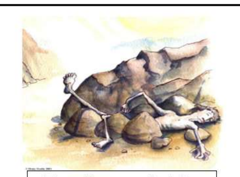
The robbers attacked the man, beat him up and stole everything he had, even his clothes.