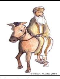
The religious leader thought: 'Oh, he looks terrible. But, I'm sure he's no one I know.' He passed him by as well.